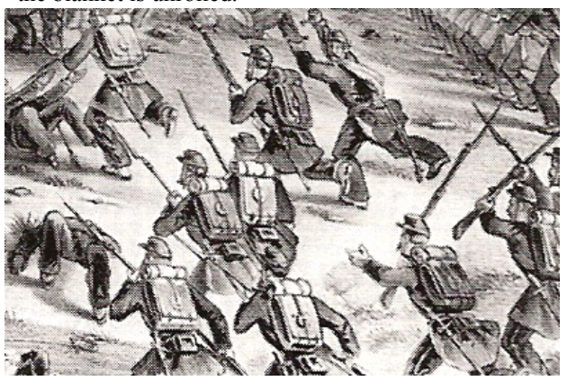
A member of the 9th Massachusetts Infantry described how a blanket roll was made:

To lighten their load while on campaign, soldiers occasionally discarded their knapsack in favor of one of the variations known as "the blanket roll". Blanket rolls were lighter and caused less back pain and abrasion on the shoulders. The disadvantage of a blanket roll was that its contents were scattered when the blanket is unrolled.