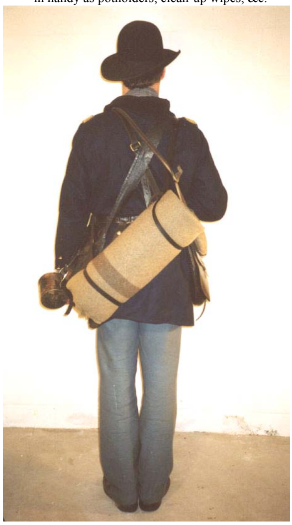
A commissioned line officer wearing a "hoboroll" blanket roll